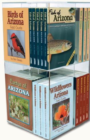
Counter Spinner #56000 / 7" x 7" x 15" / $40