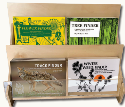
NEW Finder Series Display #F5888 / 13" x 10" x 7" / $16 holds up to 32 Finder books