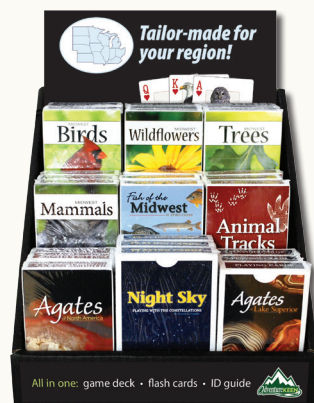
Playing Cards Display #56038 / 9" x 9" free with order of 27 decks