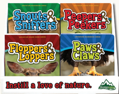
Board Books Display #56041 / 13" x 6.5" free with order of 12 books