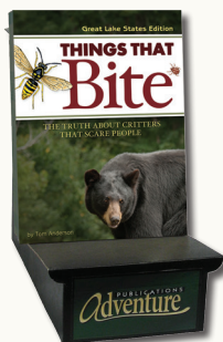
Open-Sided Display #56008 / 6" x 9.5" (fits all titles) free with order of 6 books