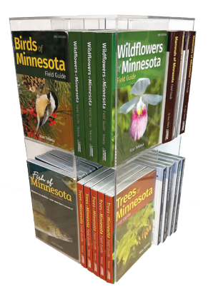
COUNTER SPINNER #56000, 7" x 7" x 15" $40 freight included

#56008, 6" x 9.5" (fits all titles) free with order of 6 books